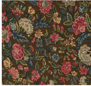
Blostma Tapestry | 333537