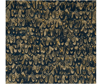
Icarus | 332928