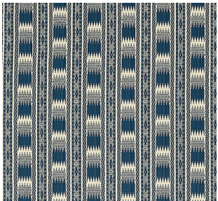
Kasuri Stripe | 333541