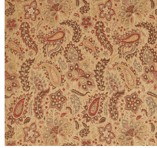
Caserta Paisley | 333538