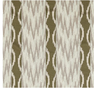
Embroidered Ikat Stripe | 333545