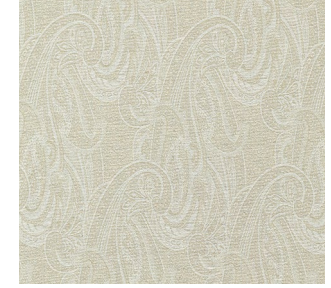
Clyde Paisley | 333540