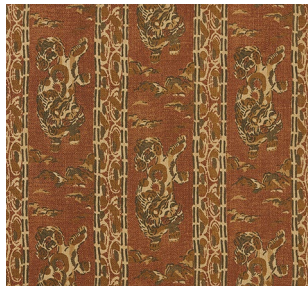
Tibetan Tiger Stripe | 322794