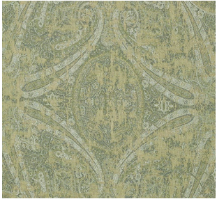
Elswick Paisley | 332802