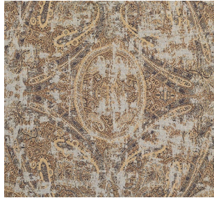
Elswick Paisley | 332803