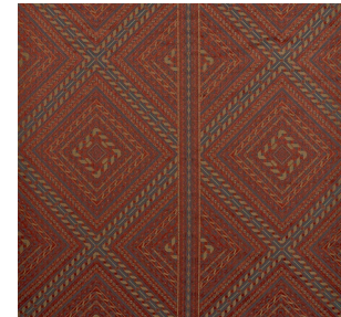
Marquetry Trellis | 333543