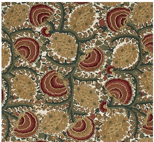
Suzanni Archive Embroidery | 333536