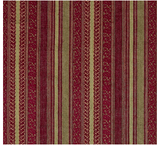
Andean Stripe | 333544