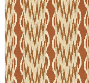
Embroidered Ikat Stripe | 333546