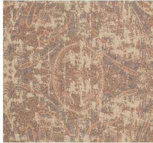
Elswick Paisley | 332804