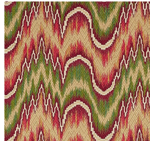
Kempshot | 333535