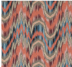
Kempshot | 332830