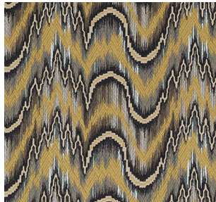
Kempshot | 332831