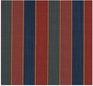
Anatolian Stripe | 333542