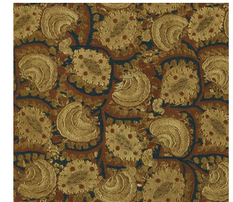
Suzanni Archive Embroidery | 333086